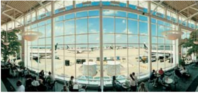
Cincinnati/Northern Kentucky International Airport (CVG) was voted the No. 1 U.S. Airport, 2004.